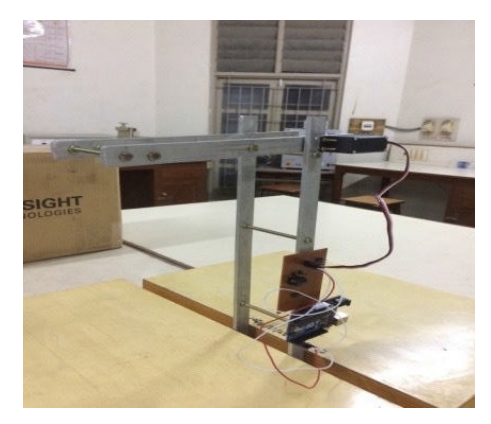
FIG.3) DESIGN OF ROBOTIC ARM

Database Management and User Interface is software part. Apart from this, designing an algorithm to locate the book to reduce the total time requirement is also included as a software.