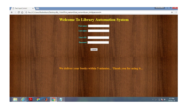
FIG.4) FRONT PAGE IMPLEMENTATION