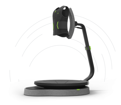
Figure 3: The new Virtuix Omni One VR treadmill [26]