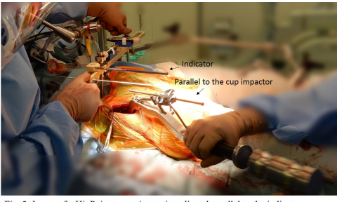
Fig. 2: In use of a HipPointer, cup impaction aligned parallel to the indicator