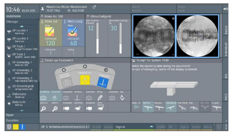
Figure 1: Graphical panel with workflow bar (lower side).

workflows during surgery as well as during reprocessing of reusable instruments and devices. The integration concept is based on the open communication standard IEEE 11073 (Kasparick et al. 2015). RFID equipped instruments help to monitor automatically each step of operation and to provide related information on the central surgical workstation if needed. The option to perform bulk reading of RFID equipped instruments also enable to check completeness of instruments sets during reprocessing and packaging as well as during surgery while searching for a specific instrument in the local OR stock during an intervention. The OR.NET approach opens the door towards the Internet-of-Things (IoT) in the operating room, providing open standards for interoperability of different devices and multisensor networks for computer-assisted knowledge based workflow navigation and monitoring. Figure 1 and Figure 2 shows an exemplary panel of the OR.NET surgical workstation developed in our lab with the workflow navigation bar and integrated checklists.