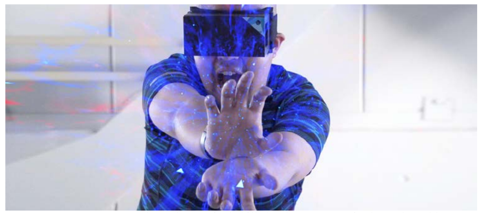
Figure 1. Everyone can shoot the magical skills by the "HADO" in the real world.

"HADO" is the combination of Augmented Reality (AR) technology, motion sensor, Head-mounted display (HMD), smartphone, and sports that creates a whole new experience that we call "Techno Sports". By wearing the arm sensor in the arm and HMD to the head, adding the AR technology, HADO actualize magical worlds everyone dreams of as a child. Shoot energy balls to smash opponents and use the shield to prevent opponent's attacks!! Think strategic, move like a lightning, and coordinate team play to flight your opponents. This is a HADO Players vs. Players battle!!