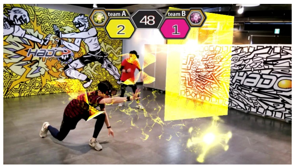
Figure 1. The play capture of HADO

"VOID"[2] and "ZERO LATENCY"[3] can be cited as a similar service. It's different in that they using VR technology and heavy equipment like gun. The experiences are like FPS game. HADO need so light equipment than theirs because of no backpack PC. HADO players can move sharply just like other sports.