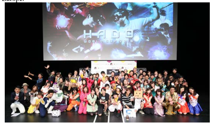
Figure 5. HADO WORLD CUP

In 26 Nov 2016, HADO WORLD CUP[9] was held at Tokyo as the world's first techno sports competition with prize money. The applying team number is almost 4 times to limit on participation, 16 teams and about 50 players participated and fought a hot fight. Approximately 33,000 audiences cheered mainly on web live streaming. HADO WORLD CUP will be held every year, and next time we'd like to invite players from Asia, North America, and Europe.