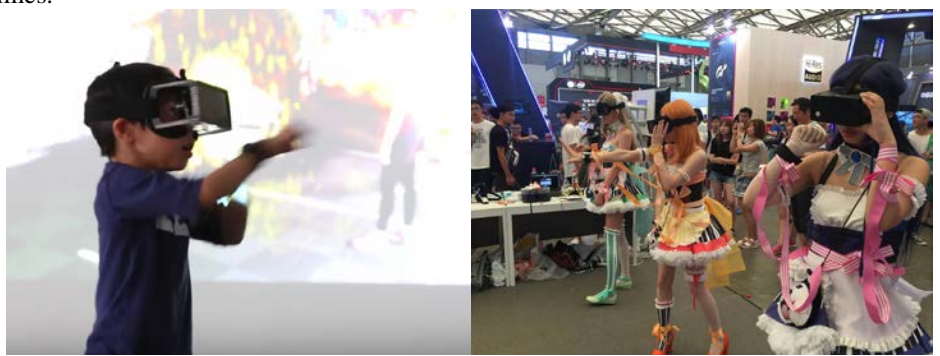
Figure 4. The various players of HADO

HADO is running as attraction or activity at mainly leisure facilities, shopping mall. For instance, domestic permanent use case is HUIS TEN BOSCH[5], NAMJA TOWN[6] and VR Center at AEON LakeTown[7]. Overseas permanent use case is JOYPOLIS at Qingdao China[8]. Temporary event use case is more than 70 locations. Depends on the situation, max capacity per day is 1,000 players. Over 600,000 people play HADO so far. Various players (friends, families especially children, couples, cosplayer) enjoy HADO for each purpose (Leisure, Sports, Exercise, Cosplay), core players play so many times.