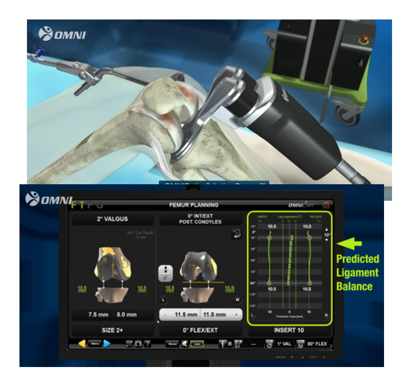
Figure 1 (top) Digital balancing device (BalanceBot) used to tension to knee after tibial resection; (bottom) Femoral resections planning screen showing predicted post-operative ligament balance in green box

Frequency of soft-tissue releases and their effect on patient reported outcomes in ... Plaskos et al.