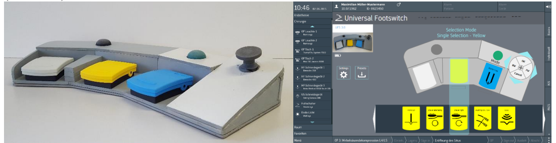
Figure 2: Universal foot switch (left) and corresponding GUI on surgical workstation (right)

The conceptual design of the GUI for visual feedback on the foot switch assignment as a modular panel of the surgical workstation has been implemented with Microsoft Expression Blend for Visual Studio and is presented in Figure 2. Here, the output can be generated in XAML, which enables a transfer to the source code of the workstation, respectively the connection with the binding code (connector).