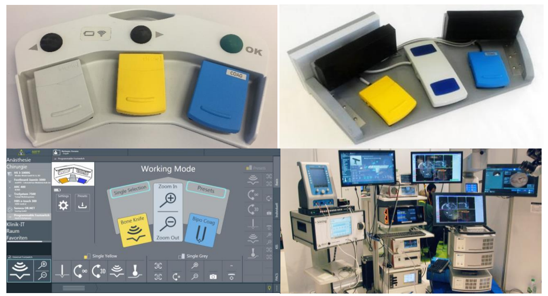
Figure 1: Universal foot switch (left up version 1.0 and right up version 2.0) and the corresponding graphical user interface of foot switch version 2.0 (lower left) and the surgical workstation (lower right)

The foot switch version 2.0 consists of three elements (two pedals and one rocker switch) for the device/function release and two elements/buttons for the functional assignment of the interaction elements. The GUI (Figure 1; down left) consists of: A model of the footswitch with the actual functional assignment in the center of the screen, a selection of single device functions for the yellow pedal and the grey locker switch, a selection of process-specific function pairs ('presets') on the right side and a small model of the two configurable pedals with the actual function set on the lower left edge (Figure 1). Both foot switch concepts have in common that the blue pedal is permanently assigned with the bipolar coagulation function in order to facilitate vascular obliteration in case of spontaneous bleeding. In contrast, the left and center pedals are programmable. First usability evaluations of the foot switch (version 2.0) have been conducted in comparison with the classical foot switch "organ" in the OR (Dell'Anna et al., 2016).