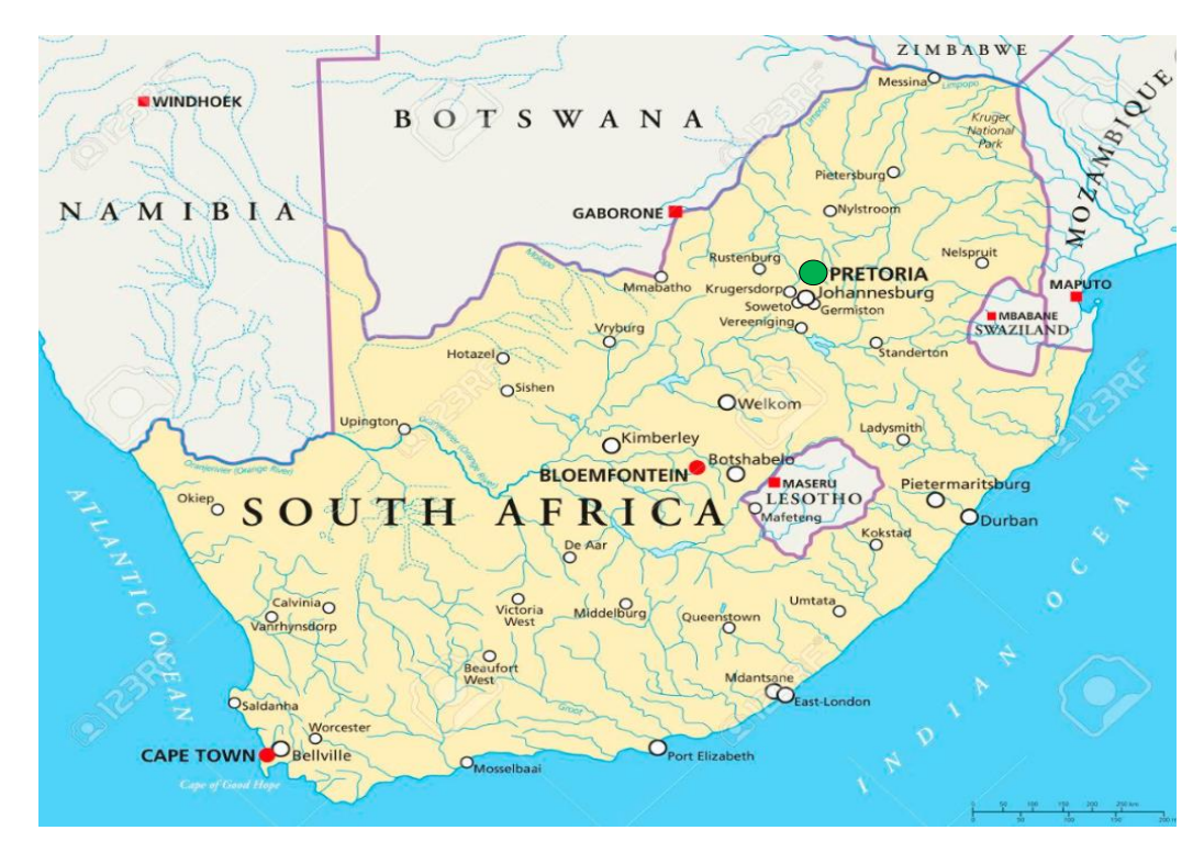
Figure 1: South African Map - Showing Pretoria (circled in green)

The new City of Tshwane has 105 wards, 210 councilors and about 2.5 million residents, and is divided into seven regions. The municipality currently offers Electricity, Water and Sanitation, Emergency Services, Metro Police and Licensing, Tshwane Bus Services, Housing, Roads and Storm Water, Waste Management and Health services to all these regions.