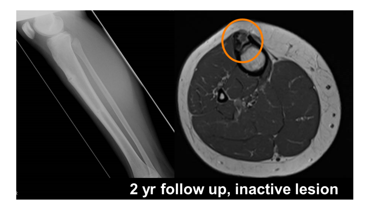
{\it CAS guided RFA can be a safe and effective treatment in OFD \dots \ \ Paul \ Jutte \ and \ Joris \ Ploegmakers}