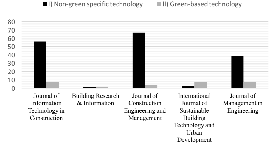
Figure 2: Related publications in the selected journals

According to the reviewed papers, following four main themes were recognized: 1) Off-line digital technologies; 2) BIM based technologies; 3) Web-based technologies; and 4) Green technologies, which are reviewed in next sections. Four themes are identified in the reviews which are summarized in Table 1.