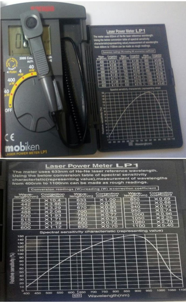
Figure 5: Laser power meter

4. Low temperature steam sterilization system E.O (Ethylene Oxide)