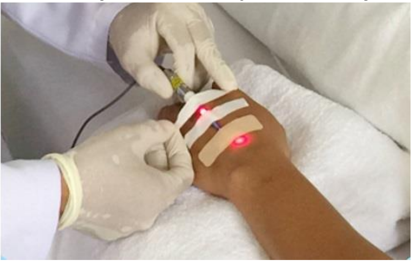
Figure 3: Paitents therapied by the intravenous low-level laser

Figure 3 shows the use of optical needle in clinical. Figure 4 shows the fiber optical needle kit.