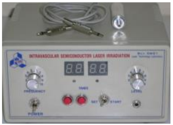
Figure 1: Intravenous low-level laser device

The treatment device consists of one controlled channel laser working at 650nm wavelength, with the following main parameters: