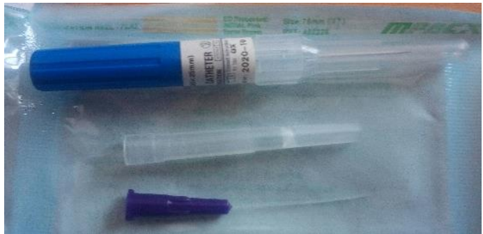
Figure 7: Intravenous optical needle kit

- Results after steam sterilization EO. The bag shows to ensure sterile conditions before use. Figure 7 shows the intravenous optical needle kit.