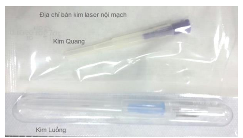
Figure 4: Fiber optical needle set used in the intravenous low-level laser therapy

Research on the production of optical needles used in intra-venous laser Dang Nguyen et al.