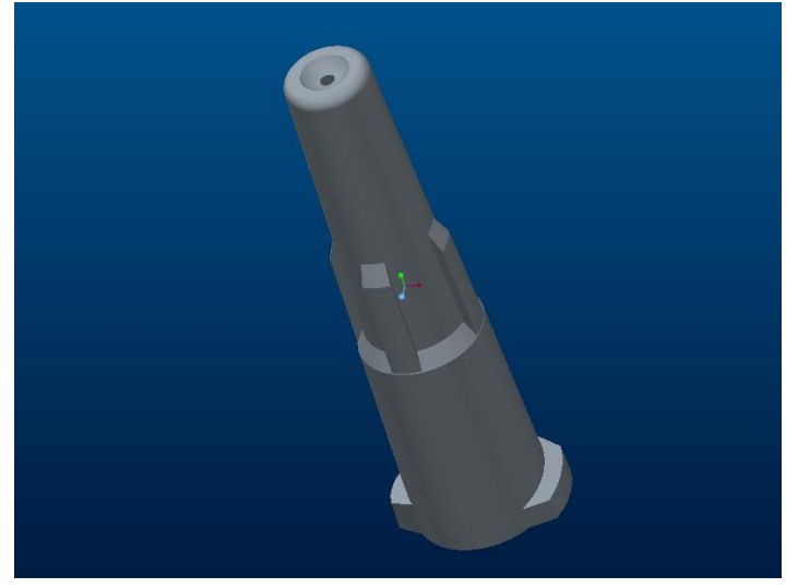
Figure 6: Simulated 3D connected to optical fiber

Testing results with a needle. Randomly take 30/1000 samples and test the remaining energy through optical fiber as follows: