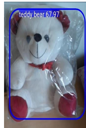
Detecting teddy bear (b)