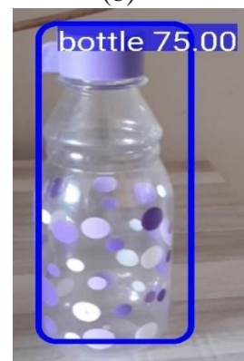
Detecting bottle (d)