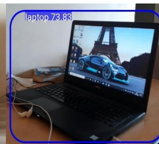
Detecting a Laptop (f)