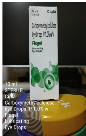
Read text example (a)

Following are some of the results which shows the prediction value of detecting an object accurately. Thus giving us an idea about the accurate performance from the model while detecting objects correctly. Possible Objects can be detected at a time but only object which was having precision value higher than fixed threshold value will be told to visually impaired user using voice output feedback. Multiple objects can even be accurately detected at a single time.