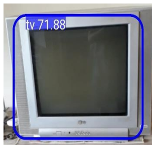
Detecting TV (e)