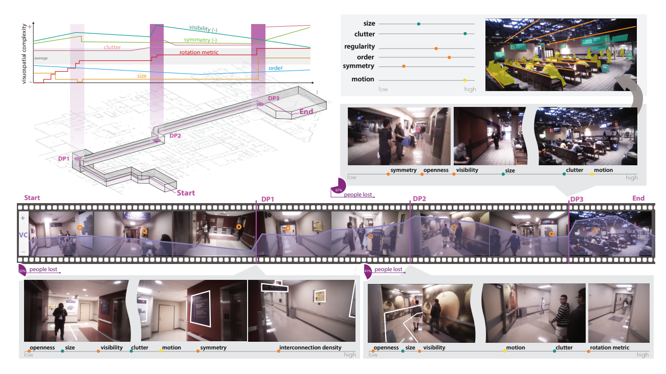
Fig. 1: Large-Scale Evidence Based Analysis of Visuo-Locomotive Experience. Analysis of visuospatial complexity as it evolves along the navigation path at the Old Parkland Hospital. Analysis of decision points (DP) where participants get lost reveal the combination of attributes that compose the current visuospatial complexity level (colors correspond to the categories of attributes of Table 1: Quantitative (green), Structural (orange), Dynamic (yellow)).