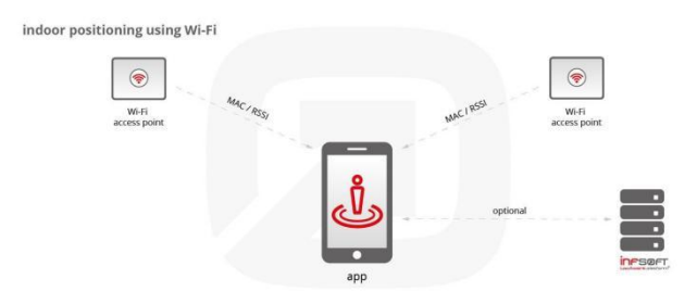
Fig. 1. Demonstrating the structure of Indoor Positioning System using Wifi