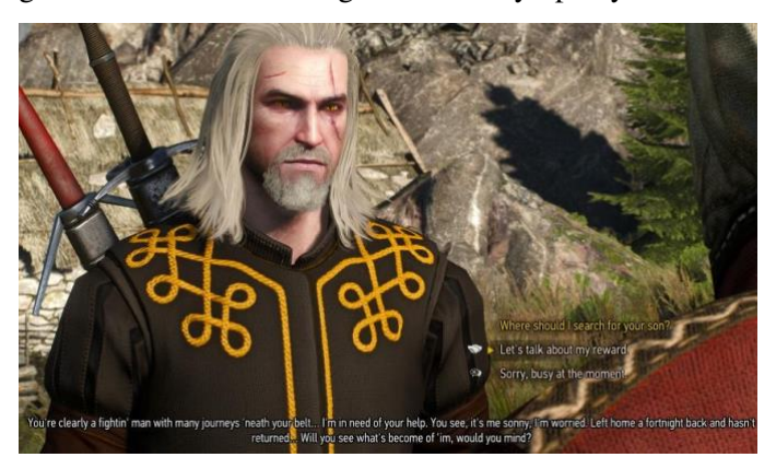
Figure 3: Geralt's responses to the man's plight: "Where should I search for your son?"; "Let's talk about my reward" (initiate negotiation); "Sorry, busy at the moment".

One of the ways such a boundary was drawn was in Geralt's avatar. Geralt as the player's vessel is significant because the repetitious and evocative narrative force of Geralt's oppression permeated my play style. The stereotype that Witchers have an inherent and insatiable love of money is feed for their public hatred and inferior social standing. Financial negotiations almost always arise when Geralt accepts quests from characters, allowing the player to barter via a slider that accommodates the NPCs (non-playable characters) "annoyance level." NPCs were sensitive towards Geralt's negotiations and did not hesitate to comment on the social significance of the transactions with tongue-in-cheek comments, like: "I know Witchers don't work for free." Other times, the player can choose to insist on a reward or offer gratuitous services, a decision seemingly free and up to the player's discretion. If engrossment is active, every previous encounter goes on to shape the next one. Times where I was treated crudely provoked aggression, whilst graceful encounters brought on more sympathy.