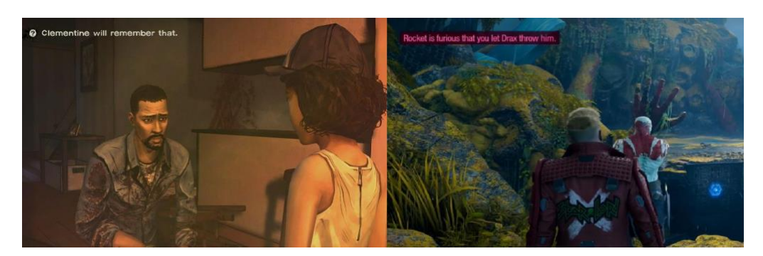
Figure 1: "Clementine will remember that." (left)

On-screen textual commentaries act as a kind of ludic feedback—rewarding, acknowledging, or reproaching a player's decisions and subsequent effects on a storyline and its characters. These intra-game messages recall one of Salen and Zimmerman's fundamentals of 'meaningful play' as such feedback provides an imbued weight to players' decisions. <sup>5</sup>