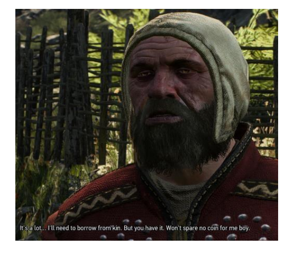
Figure 4: The man's response to a high barter: "It's a lot... I'll need to borrow from kin. But you have it. Won't spare no coin for me boy.