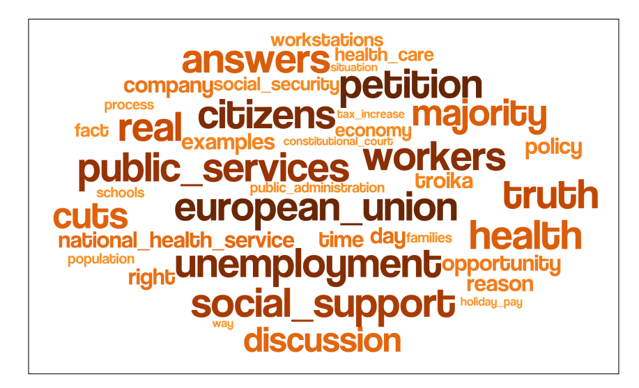
Fig. 4. The 40 most relevant key-phrases extracted from PEV speeches collection.