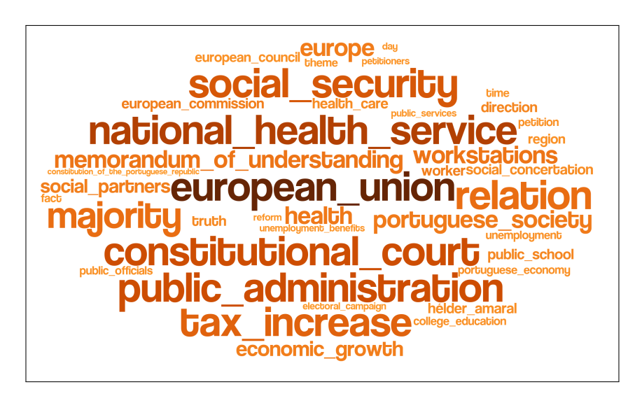
Fig. 3. The 40 most relevant keyphrases extracted from PS speeches collection.