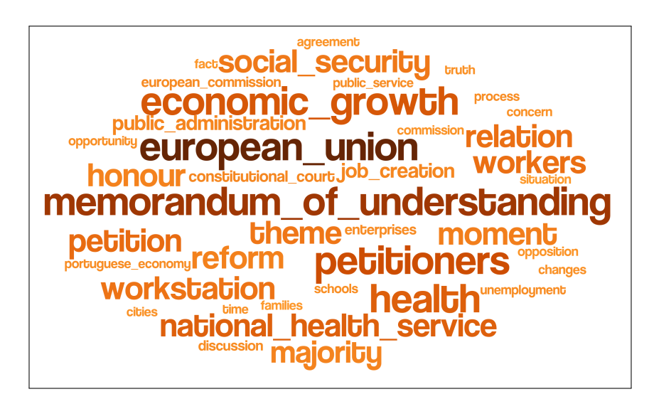
Fig. 7. The 40 most relevant keyphrases extracted from CDS-PP speeches collection.