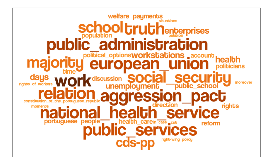
Fig. 6. The 40 most relevant keyphrases extracted from PCP speeches collection.