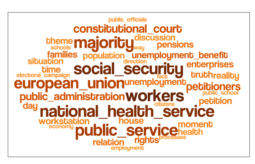
Fig. 5. The 40 most relevant keyphrases extracted from BE speeches collection.