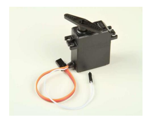
Fig. 5 Servo Motor

It is a special type of motor based on the servomechanism. It offers precise control of position (both linear and angular), velocity and acceleration. It is a motor that contains an additional sensor to provide feedback control (in case of position sensor a potentiometer is used). Unlike other motors which wait for the stop instruction to stop servomotors stop after every input signal and wait for another thus providing precise movement.