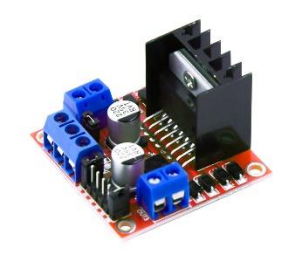
Fig. 4 Motor Driver- L298N

Unlike servo motors other DC motors do not have a direct interface present to get connected to the microcontroller (like in this case Arduino). In order to interface these motors to Arduino we need a motor driver (e.g., L298N). Motor requires a relatively large amount of current to operate whereas microcontrollers require low current signals. So the function of motor driver is to take low current signals from microcontrollers and then convert them to high current signals for the motors.