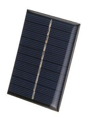
Fig. 1 Solar Panel

electric current. This process is called the Photovoltaic effect (hence the solar panels are also called PV panels). The electricity produced is the DC type, it is converted into AC current by the use of inverters. The battery banks are used to store the surplus amount of electricity for later use.