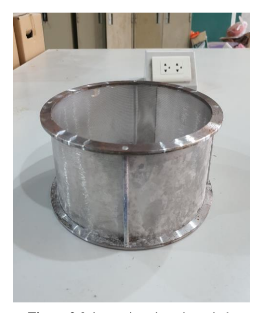
Figure 2 0.4 mm sieve in a rice grinde

After each type of rice is ground with a pin mill rice grinder two separated times using different sizes of sieve, each rice flour was thoroughly tested by shaking with a sieve shaker using a 140-mesh sieve. The reason for using this particular sieve is that the fineness of the rice flour should not be coarser or rougher than 140 mesh to suitably be used in baking or cooking (Ravangsamrong, 2017). The researcher used 50 grams of rice flour to measure the amount of rice that remained on the sieve. The data, then, was analysed for any variances.