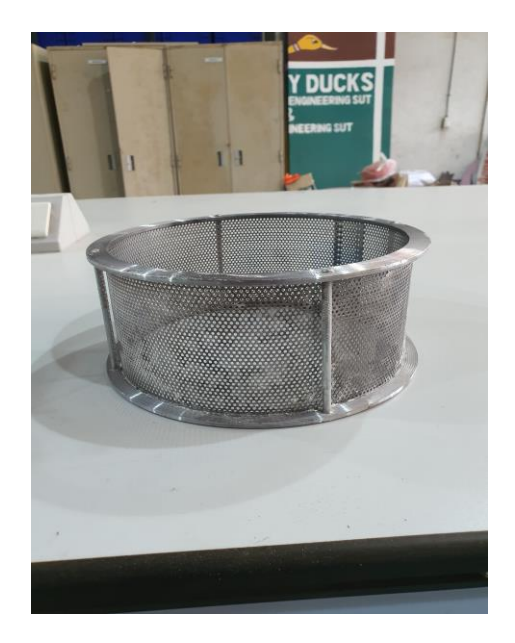
Figure 1 1 mm sieve in a rice grinder

Originally, a small pin mill rice grinder was widely commercially available in the size of 750x400x1070 mm and the sieve hole inside the rice grinder was 1.0 mm, as shown in Figure 1. The rice flour obtained from using this type of grinder cannot be used for baking or cooking due to its rough and bumpy texture. Its particles are also quite big in size. Therefore, it was improved by changing the sieve hole in the rice grinder to be smaller. The smallest sieve available in Thailand has a hole size of 0.4 mm, as shown in Figure 2, which could help obtain rice flour with a similar finesse to the rice flour sold in the market. In this experiment, four types of rice were used, namely jasmine rice, glutinous rice, riceberry rice, and brown rice to compare the fineness of each type of rice.