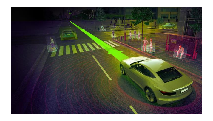
Fig-(3) Sensor collecting data

trash, road markers, warning boards and more. All of these are converted into members and are passed to the cloud for further analysis.