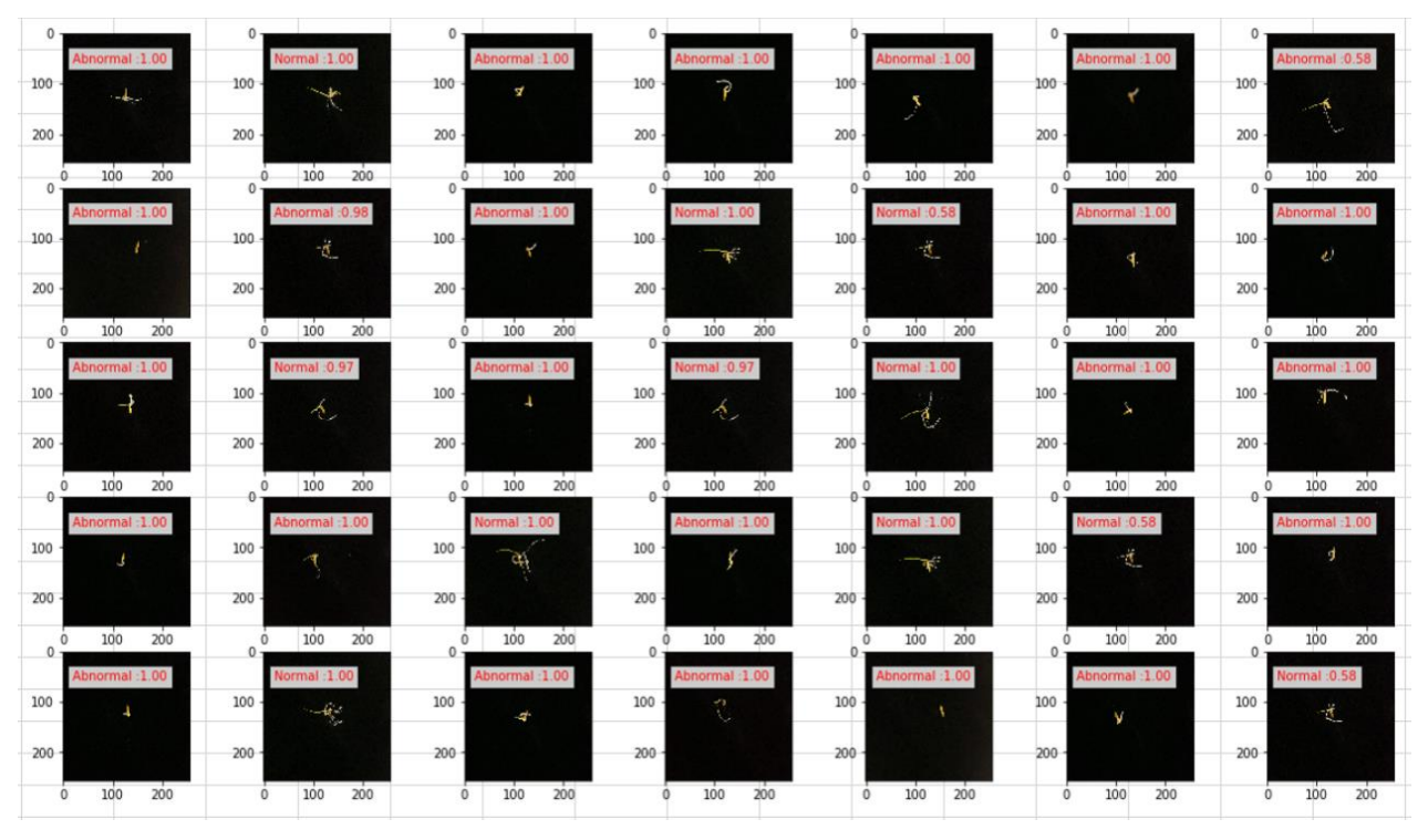
Figure 6. Test results