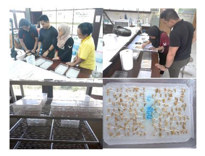
Figure 2. Seeds cultivation germination process.