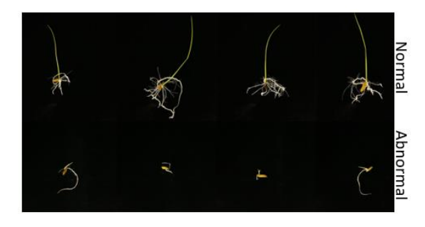
Figure 1. Sample normal and abnormal images.

We obtained images from seeds cultivation in the seed laboratory of the Surin Rice Seed Center, Surin Province. We collected sets of seeds randomly from seed group. Then, we cultivated the seeds and stored in the normal environment room with normal light, and kept the seeds to grow for a period of 7 days.