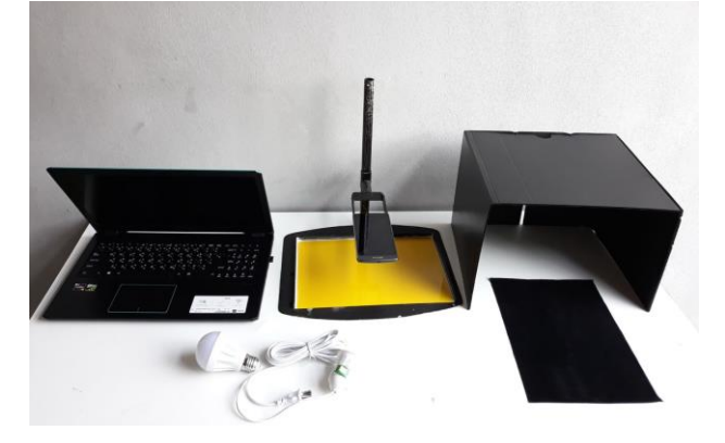
Figure 3. Picture of instruments used for collaborating and taking pictures.

After all, we successfully collected 1,562 images and separated them into two groups, normal germination, and abnormal germination. We collected 76 images and mixed both the abnormal and normal germinated rice together for testing.