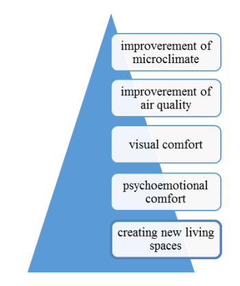
Fig. 1. The "objective tree" for development of the vertical gardening of the buildings

The discovered objectives and tasks allow us to determine the whole range of measures for the formation of comfort of the environment using various technologies of vertical gardening, Fig.1.