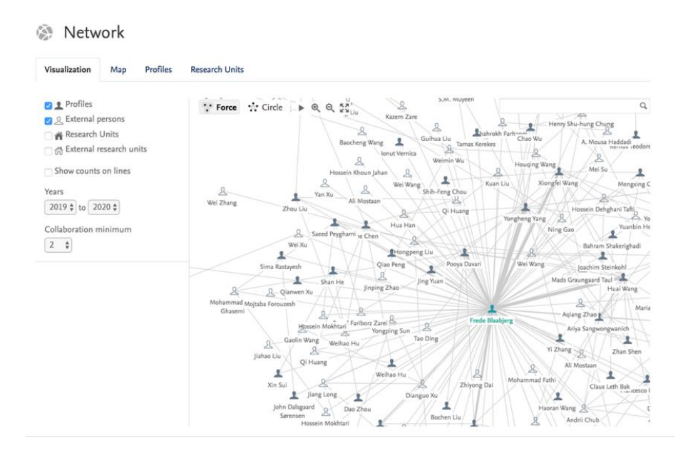
Figure 2. Network visualization of researchers with other individuals and research units.

The interviews were exploratory and open ended, and the informants were asked questions about the following themes: 1) understanding the contexts of the informants and their perceptions of UII and RIMS; 2) evaluating the categories and metadata in the RIMS; 3) evaluating graphic visualizations in the RIMS; and 4) gathering insights as to whether the RIMS can facilitate UII. The interviews were started by asking the informants to sign a consent form, and they were conducted in natural settings with the informants sitting in their offices. The interviews with informants 1 and 2 were conducted in person at their offices, while the interview with informant 3 was conducted online, wherein the informant sat in his office and the researchers in the university. The researchers shared their screen with the informant during the interview to allow the informant to explore the RIMS. The interviews were recorded and transcribed, leading to more than 160 min of interview video in total.