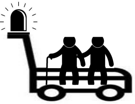
Fig.5 The "police robot – cleaning robot – transport robot" system's positive synergistic effect

Synergistic effect of combining several city services. For example, a city streets cleaning robot can additionally act as an observer to assist police, nonurgent transportation of objects and citizens with limited mobility (Figure 5).