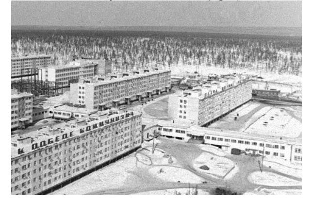
Fig.2 The covered gallery in Udachny city (Yakutia)

There are also known Soviet projects of Arctic cities in the middle of the XX century, one of which partially realized in Udachny town in Yakutia (fig. 2).