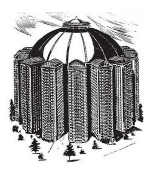
Fig.1 Abram loffe's project of the building-city

The story of increasing energy efficiency in cities probably begins with King Gillette's book «The Human Drift», published back in 1894, in which he proposed the idea of the «Metropolis» – house-city designed for a huge number of residents [3]. There are projects of similar buildings-cities in the USSR, for example, the project of a house for a million inhabitants from academician Abram Ioffe (fig.1). For a number of reasons, these projects are utopian, being dependent on the risks of fire or, for example, an earthquake. In addition, humanity is not yet ready to completely relocate to this kind of city-building.