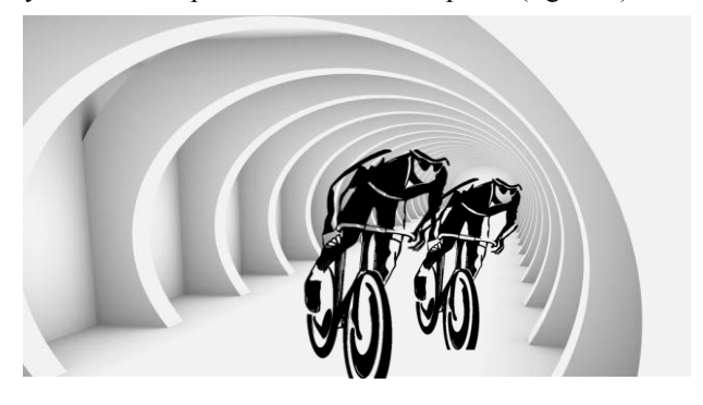
Fig.3 The "cyclist – heat-insulated bike path" system's positive synergistic effect

Using the townspeople warmth. Each person emits heat energy of the order of 100...120 W when sitting at rest, 150...220 W when moving and when working lightly, 300...430 W when walking fast and doing active physical activity. With a large crowd of moving people, you can get quite a large amount of thermal energy, if you do not disperse it into the atmosphere (figure 3).