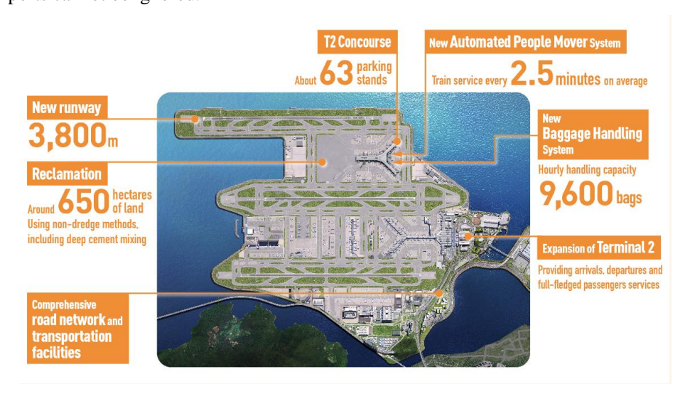
Fig 3. Hong Kong Airport Third Runway System Expansion Diagram

Although Macau has launched recent and long-term expansion projects to attract and accommodate more passenger flows, the airports in surrounding cities are also rapidly expanding. Hong Kong Airport is constructing a third runway and supporting facilities such as an aviation city, which is expected to handle 120 million passengers and 10 million tons of cargo annually after completion in 2024. The third phase of Guangzhou Airport expansion and the construction of a third runway at Shenzhen Airport will both be completed by 2025. Zhuhai Airport, which is only 26 kilometers away from MIA, will also be completed and put into use in 2023 with a new Terminal 2, and is actively promoting the opening of international routes. Despite the unique advantages of MIA, such as its small, intensive, and sophisticated characteristics and proximity to large hotel clusters and tourist destinations, the competition and passenger diversion from surrounding airports cannot be ignored.