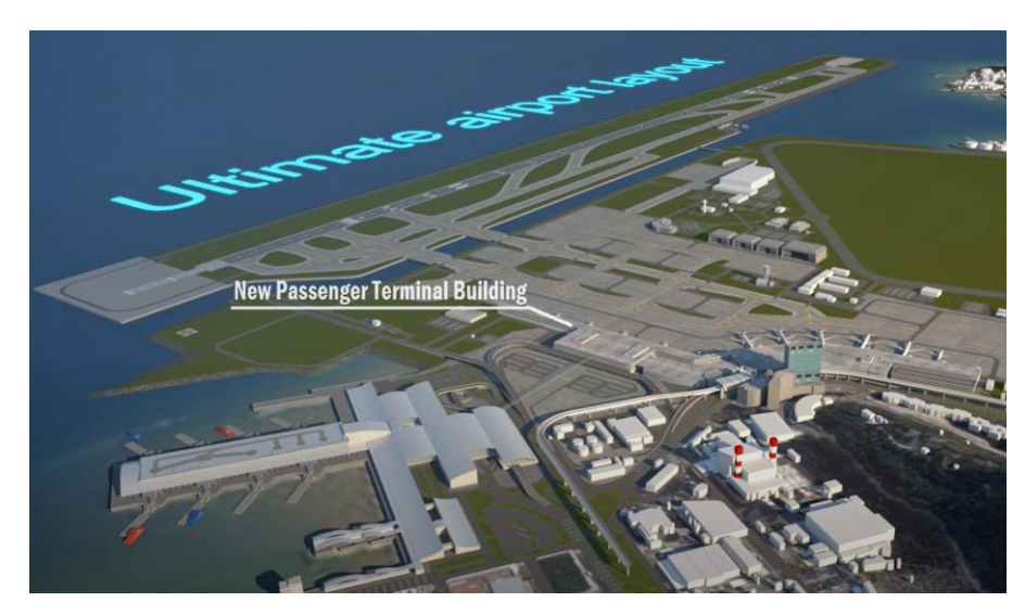
Fig 1. Location map of MIA