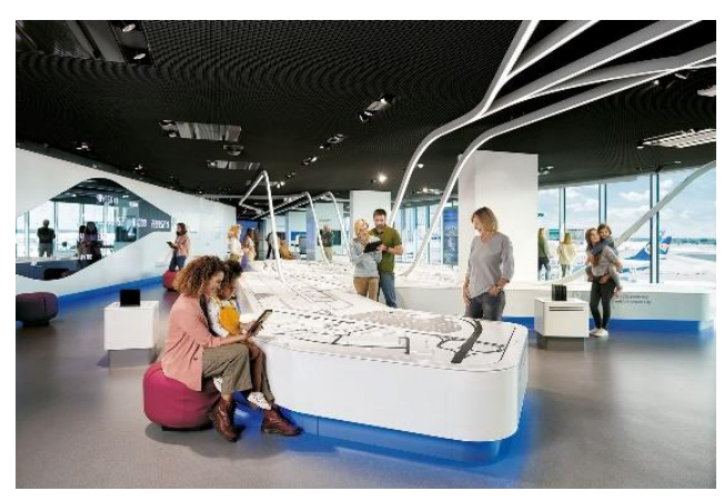
Fig 6. Indoor waterfall at Singapore Changi Airport (Source: www.gooood.cn) Fig 7. Experience Center at Frankfurt Airport (Source: www.gooood.cn)

MIA can draw inspiration from these global best practices and explore ways to develop creative and appealing urban attractions that highlight the city's unique cultural and natural heritage. Through the use of interactive devices such as virtual reality, MIA can enhance the passenger experience and contribute to the city's overall tourism offerings.