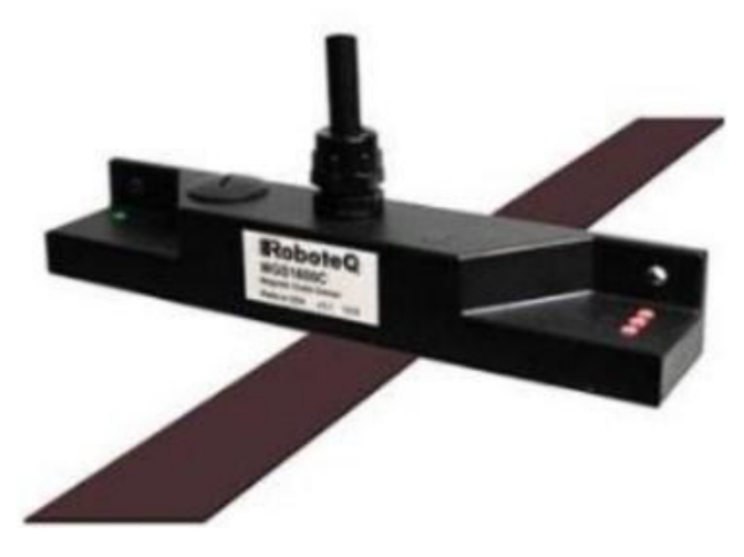
Fig.3 Magnetic Tape and sensor [1]