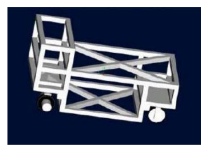
Fig,2 AGV frame design [2]

[2]The design of the AGV represents a large role in the tasks to be performed. The central elements of the vehicle perform the actual transport task. Other elements are used as input or active signal elements of the AGV. All of these correspond to the central factor and the combination of all factors leads to the actual performance of the AGV missions.