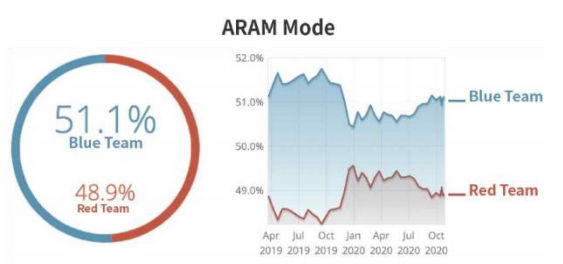
Figure 2. ARAM mode (a perfectly symmetrical map mode) in a popular MOBA game League of Legends

A change in the game perspective can affect game mechanics (Beat Suter, 2018). The character setup in MOBA games, such as attack style and skill release, is partially controlled by the perspective. Similarly, the game map design in MOBA games is centered on the game perspective. Visual limits restrict character design and the building of new maps. Jing Li (2020) stated that the victory percentage can be low if the MOBA game is played without a suitable perspective. According to an analysis of the ARAM mode in the popular MOBA game League of Legends, when the game variables were only the game perspective and the players who were all equally skilled, the difference in the win rate between the two teams on the map was more than 6%, and the map became perfectly symmetrical (Jing Li, 2020). The findings of the study reveal that the game's perspective has a significant impact on the game's success rate and the player's overall experience with the game (Jing Li, 2020), as shown in Figure 2.