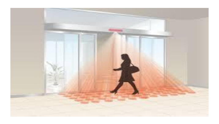
Fig 2.0 A censoring door which detect the person in front of him and open Automatically with the help of sensors.

As we find out about LIFI lets discuss a touch IOT internet of things, during this all the items are connected to at least one another with the assistance connection and that they are often control by the assistance of a sensor. The automated door Fig 2.0, Automatic lights are the instance of IOT. IN IOT we controlled of these things through internet or with the assistance of other wireless connection like Bluetooth. IOT devices make our life much easier and suitable for us and it also help us to not use extra energy for instance after we don't seem to be home all doors are automatically. So we don't need to go to every door to lock it.