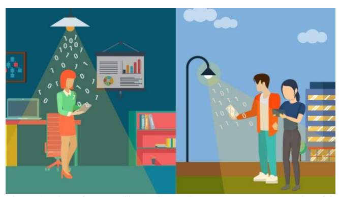
Fig 1.0 The Figure tell us about the LIFI system Work with the assistance of LED lights and blub. [6]