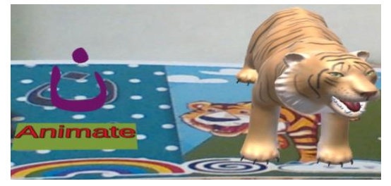
Figure6: 3D model with Augmented Reality The animated 3D model has a c# script to change its scale and position, in a way to make the kids interact with the augmented models.

Arabic alphabets level This level targets to teach kids the Arabic alphabets in a magical way to support kids' learning content skills through imaginative and intriguing play. This level is made in a way that attracts the kids' attention by images ,colours, augmented models and sounds. It is the first level in the Arabic track.