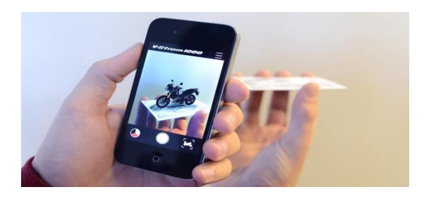
Figure 4: Augmented Reality