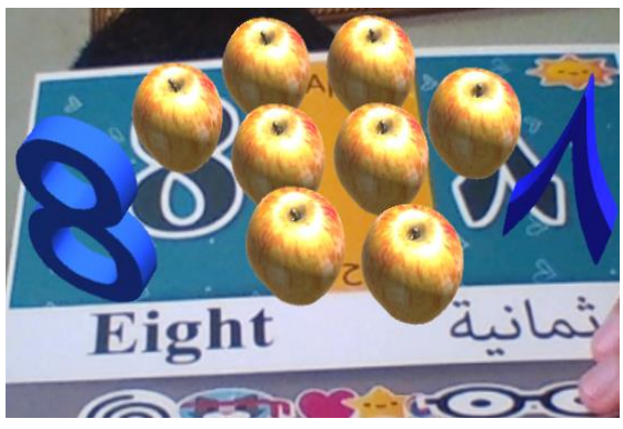
Figure 8: AR Numbers on play mode

The 3D models have c# script that makes it rotate by a 360 degree as well as changing its scale and position in a way to make the kids interact with the augmented models.