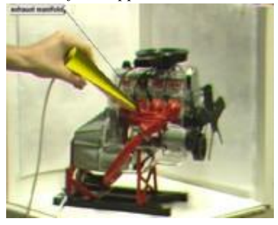
Figure 1: Engine model part labels appear as user points at them.

shows this, where the user points at the exhaust manifold on an engine model and the label "exhaust manifold" appears.