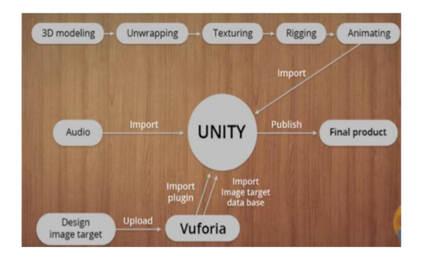
Figure 3: DFD to create entity modules

AR is developed into apps and used on mobile devices to blend digital components into the real world in such a way that they enhance one another, but can also be told apart easily.