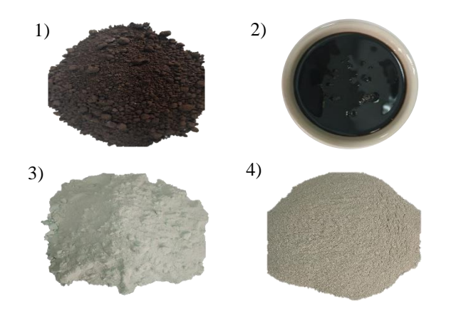
Fig. 1. The initial components for new soil amendments production: 1) leonardite; 2) molasses; 3) FeSO<sub>4</sub>; 4) bentonite

Bentonite increases the strength of granules and as well as molasses make the granules denser. In addition, due to high hydrophilicity of bentonite its particles intensively absorb moisture that leonardite contains. The following technological scheme of production of soil amendment was developed (figure 2).