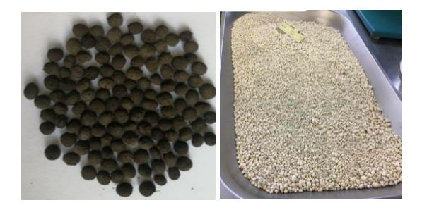
Fig. 3. Final organic soil amendment (left side of figure) and organo-mineral soil amendments (right side of figure)

Granulation of amendments allows obtaining homogeneous granules of spherical forms, reducing consolidation of a product and preventing the destruction of a product during transportation. The technological solution for production organo-mineral amendment (OMA) involves the combination of organic compounds and mineral fertilizers in organo-mineral form (figure 3). The period of nutrients releasing from organo-mineral mixtures into a soil is longer compared to organic materials. The organomineral amendment production could be adapted to meet different specific needs (soil type, particular crop requirements for nutrients etc.).