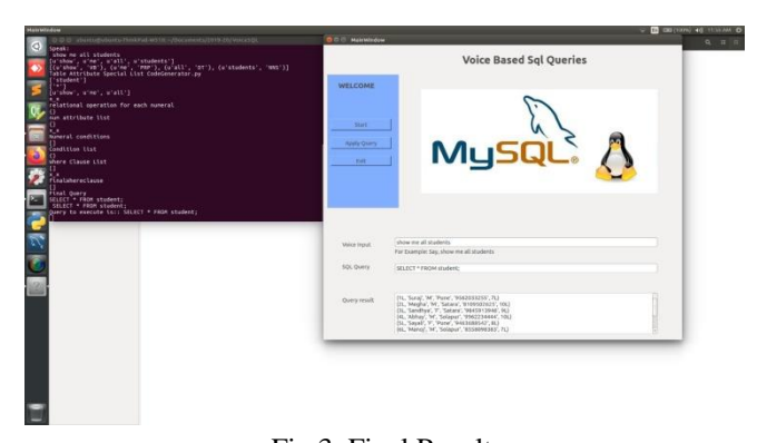
Fig 3. Final Result