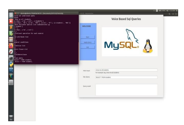
Fig 2. Voice to Query Generate