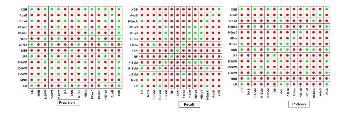
Figure 4: T-test: Precision, Recall and F1 scores of all the methods

result of different techniques for each of the performance metric, precision, recall and F1 scores. The green dots in Figure 4 indicate that the considered null hypothesis is accepted, i.e., the performance of the models does not depend on techniques; similarly, red dots indicate that there would be a difference in the performance of the models developed using different techniques. From Figure 4, we can observe that the predictive power of the models developed using different techniques are significantly different. From Figure 4, we can also observe that the ensemble methods significantly improved the performance of the models.