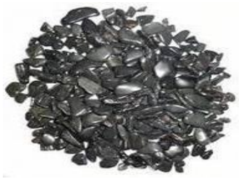
Fig. 2 Kota Stone Chips

Kota stone is a fine grained variety of lime stone quarried at kota district, rajasthan, India. Kota stone industry generates both solid waste and stone slurry. During the process of cutting, in that original stone waste mask is lost by 25-30% in the form of dust. The study concerns mainly on the possible use of stone waste in construction industry, which would reduce both environmental impacts and the production cost. Concrete works in the construction industry are particularly important as it is not only responsible for consuming natural resources and energy but also its capacity to absorb other industrial waste. The main objective of this investigation is to increase the compressive strength of concrete blocks and decrease the cost of concrete blocks by replacing aggregates with the Kota stone chips.