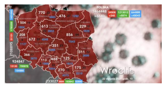
Fig.1. The COVID-19 pandemic in Poland.

Figure 1 shows the epidemiological situation in Poland as of July 16 this year. In Lubuskie Voivodeship, there are 261 people infected with the coronavirus, of which 146 recovered and 1 person died [2].