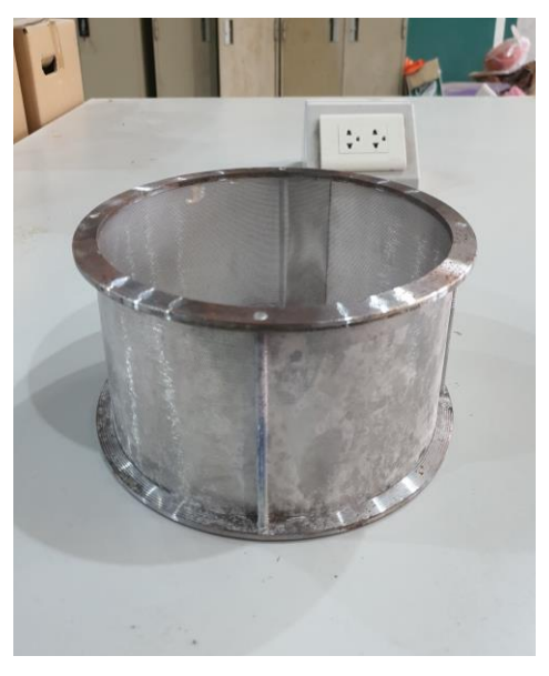
Figure 2 0.4 mm sieve in a rice grinde

After each type of rice is ground with a pin mill rice grinder two separated times using different sizes of sieve, each rice flour was thoroughly tested by shaking with a sieve shaker using a 140-mesh sieve. The reason for using this particular sieve is that the fineness of the rice flour should not be coarser or rougher than 140 mesh to suitably be used in baking or cooking (Ravangsamrong, 2017). The researcher used 50 grams of rice flour to measure the amount of rice that remained on the sieve. The data, then, was analysed for any variances.