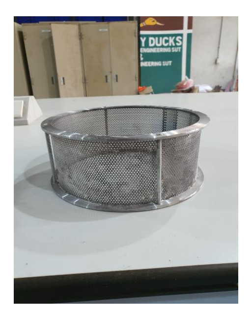
Figure 1 1 mm sieve in a rice grinder

Originally, a small pin mill rice grinder was widely commercially available in the size of 750x400x1070 mm and the sieve hole inside the rice grinder was 1.0 mm, as shown in Figure 1. The rice flour obtained from using this type of grinder cannot be used for baking or cooking due to its rough and bumpy texture. Its particles are also quite big in size. Therefore, it was improved by changing the sieve hole in the rice grinder to be smaller. The smallest sieve available in Thailand has a hole size of 0.4 mm, as shown in Figure 2, which could help obtain rice flour with a similar finesse to the rice flour sold in the market. In this experiment, four types of rice were used, namely jasmine rice, glutinous rice, riceberry rice, and brown rice to compare the fineness of each type of rice.