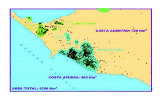
Fig. 1, Location of the Marginal Oil Field

The Block 2 include the marginal oil field, located in the Santa Elena province that includes an area of 744 Km<sup>2</sup> onshore and 456 Km<sup>2</sup> offshore, adding a total of 1200 Km<sup>2</sup>, as shown in figure 1 [3].