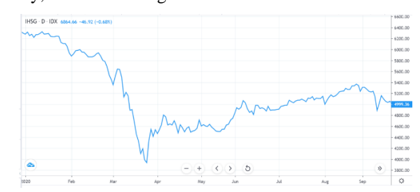
Figure 1. IDX Composite movement in 2020.

Entering the era of the COVID-19 pandemic in 2020, the movement of the IDX Composite Index fluctuated wildly, as shown in Figure 1.