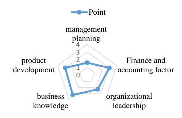
Graph 4 Figure 4 shows the current state of factors involved in the development of small and medium enterprises

Figure 4 shows the current state of factors involved in the development of small and medium enterprises. The state can be sorted, according to the research articles, from the highest to least importance as follows: