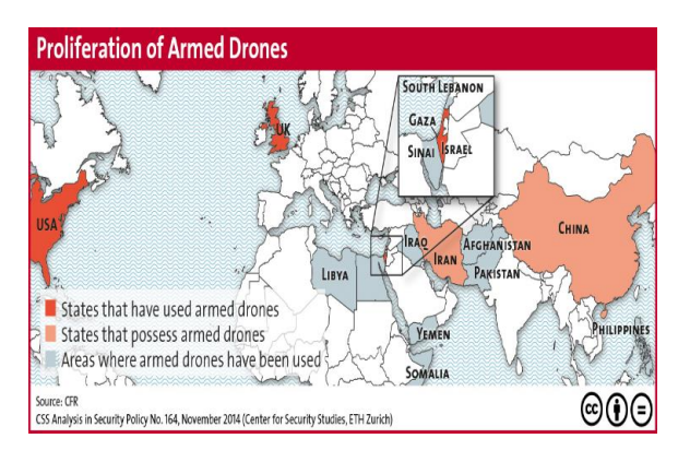
Figure 2: Proliferation of Armed Drones (Source)

outcome of the system that are faster and more capable than human by order of magnitude.