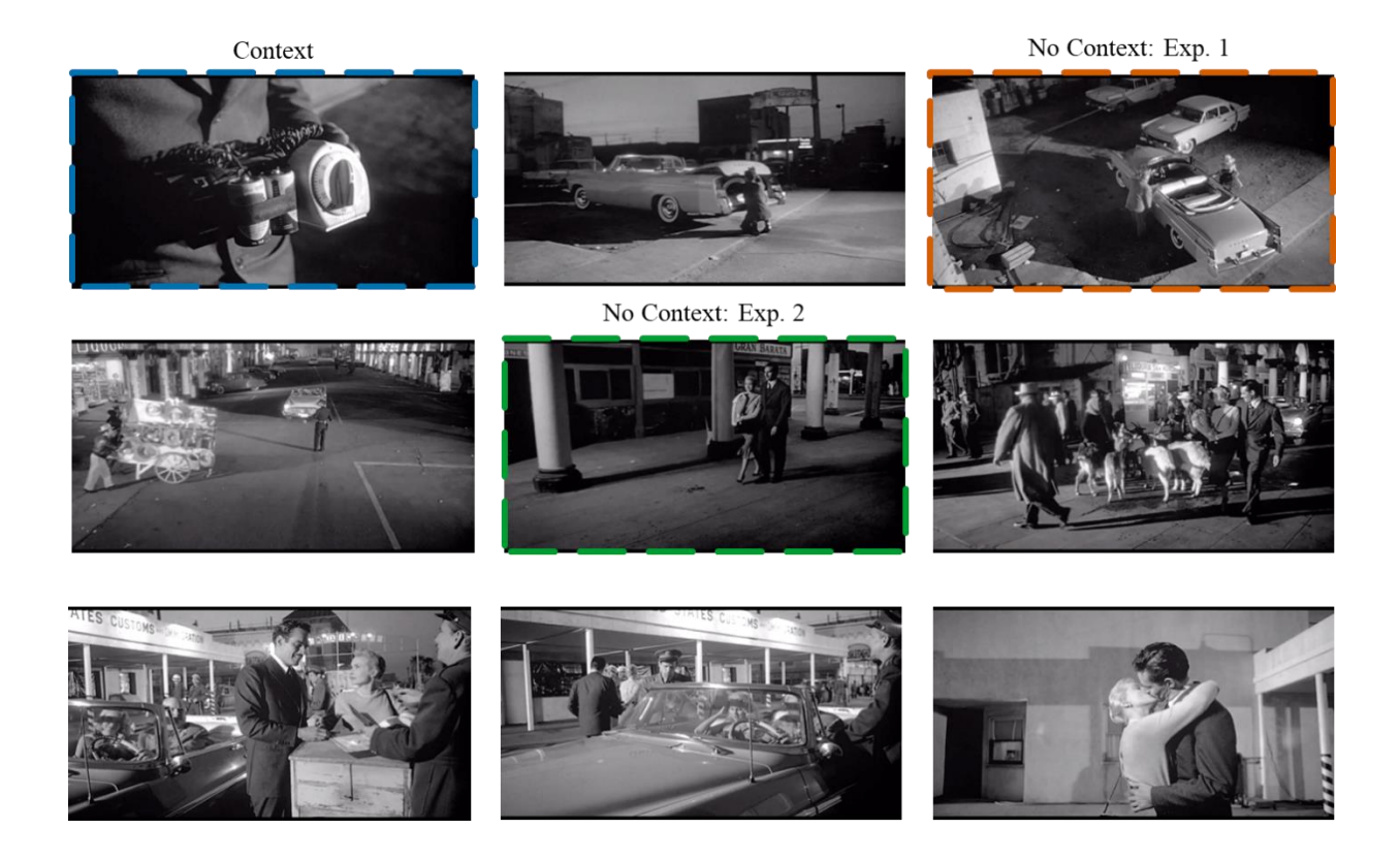
Figure 1. Frames illustrating important shots in the 3 minute 12 second clip from the film Touch of Evil (Welles & Zugsmith, 1958).