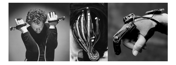
Figure 2: The Hands, the lady's glove, The Finger.

The nUFO is inspired by the classic work of Michel Waisvisz The Hands and Laetitia Sonami's lady's glove , who pioneered digital realtime-performance and performed groundbreaking music-by-movement with the aid of self-devised, sensor-based interfaces. Like many more recent similar works in the NIME context (e.g. Dominik Hildebrand's The Finger and others), their instruments/ setups were/are so highly tailored to their personal artistic practice and concepts that making them available for others as is makes little sense. On the other hand, making general music interfaces based on inexpensive motion tracking devices and gestural sensors has almost become its own genre practiced in local and international communities like MoCo, NIME, ICMI, or MovLab Berlin.