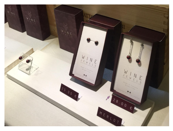
Fig.1 - wine jewelry.

Wine is a traditional produced in Italy. It is usually for drink, or for making some desserts such as cakes and chocolates. Even developed some health care products, skin care products and so on. A variety of wine festivals or fairs are held for promotion and sales every year . But at this year's wine tasting, surprises were found with wine-wearing accessories. This is a very interesting creative agricultural product design. It combines the technical characteristics of Murano's glass craftsmanship and traditional jewelry craftsmanship to make exquisite glass beads earrings, and then injects the wine into small glass spheres for sealing. Different of wine earrings show different colors, crystal clear in the sun, very beautiful and distinctive. Another case is a designer developed a special materialmade of drying and compressing the lemon sheet, then use it to design the lampshade which exbition at the 83th Florence International Artisan Fair . These are typical creative agricultural products designed. Inspired the development direction of new creative agricultural products design. (Figg. 1, 2).