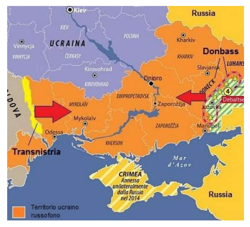
Figure 4. East-West pincer action on Russian-speaking Ukrainian regions and Ukraine's risk of losing its outlet to the Black Sea.

Kiev is well aware of this, whose openings to the West have been paid dearly with a pincer encirclement entrusted to the pro-Russian separatist regions of Transnistria and Donbass<sup>19</sup>.