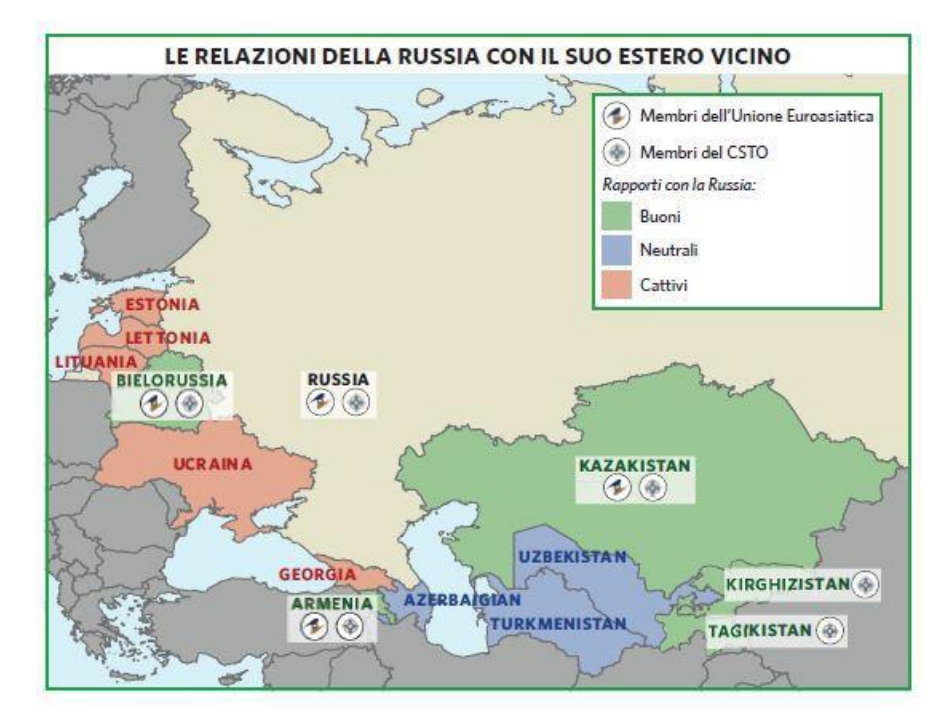
Figure 2. Russian "Near Abroad"

With the disintegration of the USSR, we are witnessing a policy that apparently wants to recognize the self-determination of the peoples of the former USSR; proof of this is a soviet law of 1990 which provided for the possibility for the same oblasts (autonomous regions) not to follow a secessionist republic on its way out of the Soviet Union and in this sense we understand for example the choise of Nagorno-Karabakh oblast not to follow independence proclaimed by Azerbaijan<sup>3</sup>, and the different choice made by South Ossetia respect Georgia; but which is actually instrumental to a russian foreign policy dominated by the fear of losing control over the "Near Abroad", characterized by very young states and for this reason highly unstable, often attracted by standard of the western model and in any case almost always motivated by strong resentments consolidated over the decades against the former dominant russian ethnic group relegated now to a poorly tolerated minority in the new neighboring countries<sup>4</sup>.