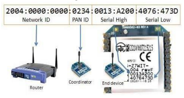
Figure.4: IP Network address

Since subsystems communicate with the main system through Zigbee protocol and we are displaying this monitored data through TCP Client, it is necessary for us to convert this received data which is in Zigbee frame format to the Ipv6 frame format.