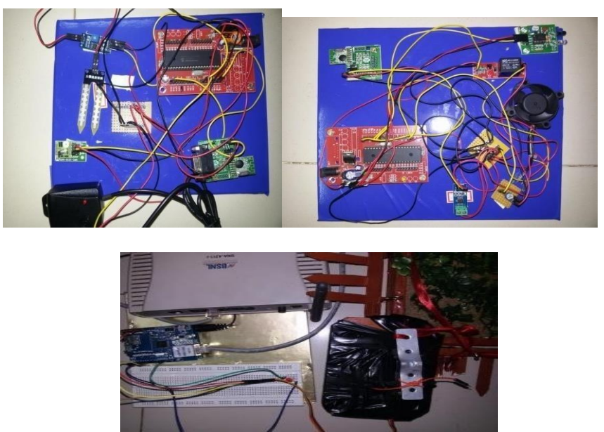
Figure.3: Practical working mechanism

The management of embedded devices such as sensor and motor which is done remotely over internet is implemented with the following architectural design and with application of Zigbee communication standards. The data sensed by smart devices is converged with Zigbee along internet which is performed with the help of internet gateway for the given wireless sensor network. The collected by the monitoring devices is collected and sent to coordinator over Zigbee wherein the translation of Zigbee protocol data format to IPV6 format is done at internet gateway.