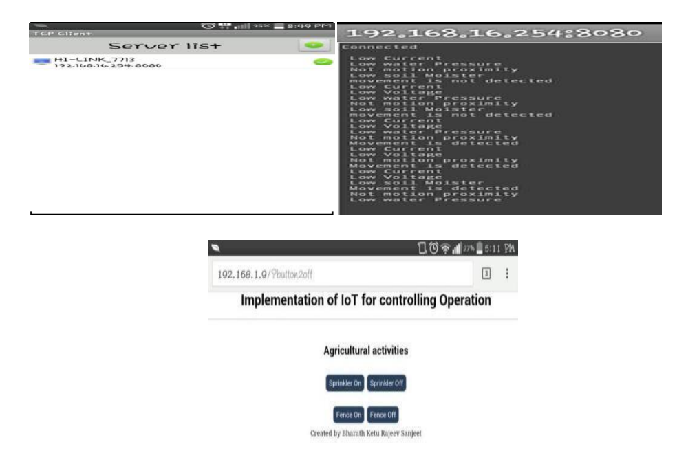
Figure.5: Programming structure and output results

The below Figures will be represent the effective representation of the monitored status and the web page being created in response to control operations respectively. These figures depict the remote access being provided to the user in knowing the deployed sensor status and also controlling required equipment accordingly, they will here represent the individual sensor status if soil moisture is found high/low then corresponding message of "high/low soil moisture", if water pressure is high or low then "high/low water pressure", if any movement found either by PrS or by vibration sensor then "Movement in proximity" or "movement detected" similarly for voltage and current sensors depicting their status given by the server listed below [3].