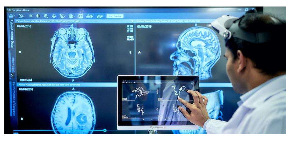
Figure 1 Remote patient monitoring devices

In addition to being fast, diagnoses with such systems are also accurate. In particular, artificial neural networks have shown that they are able to accurately detect certain diseases such as malignant melanoma.