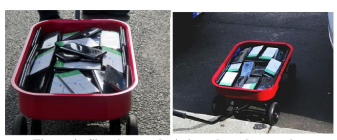
Figure 4 - Site pictures depicting adopted smartphones.

Since the pictures depicting adopted smartphones (see Figure 4) are insufficient to discover device details, we explored the Web to find other helpful information. In a video posted by Arte TV^{10} , we catch the image in Figure 5 from which smartphones are better visible. The first remark regards the difference between smartphone screens in Figure 4 and Figure 5: in this latter, despite the lack of light concerning the experiment execution, screens are darker and less visible.