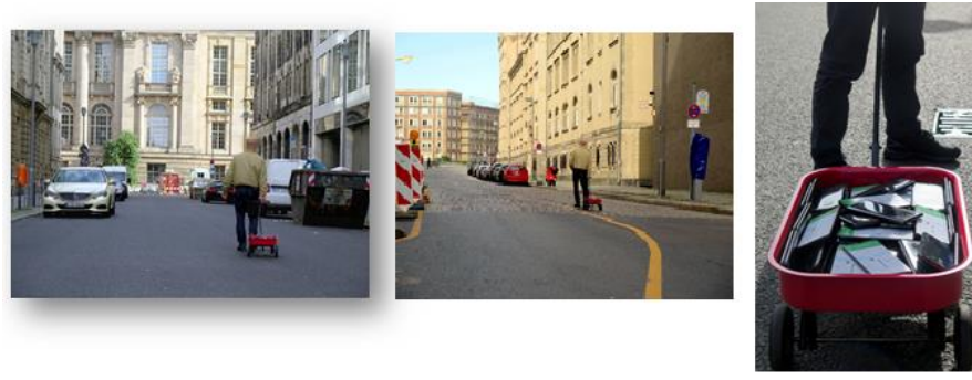
Figure 6 – Site pictures in temporal sequence.

By a search on Wolphram Alpha, at the given date, the weather is congruent with the conditions in the photos. Moreover, the sun's direction, evaluated through sunCalc, is congruent with the lights in the pictures.