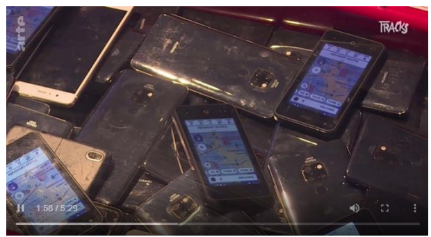
Figure 5 - Smartphones adopted during the experiment.

Another crucial element to prove experiment truthiness is geo-localization. Since the smartphones are all grouped in the wagon, they have very close GPS coordinates or even the same, which is not the case of a traffic congestion scenario but more similar to an accident with 99 vehicles involved. Therefore, even though fascinating and unreal, the 99-car accident thesis must be rejected since the cart moves and crashed cars do not move.