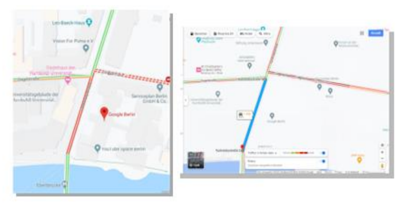
Figure 8 - Comparison between a walking path (on the right) and a driving path (on the left). In this latter, a blue line covers the road space.