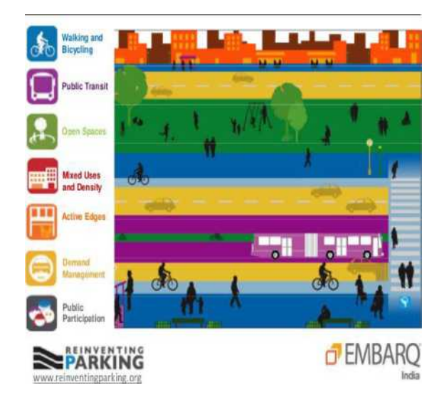
FIG.1: Transit oriented development principle

TOD focuses on compact mixed use development around transit corridor such as metro rail, BRTS etc. International examples have demonstrated that though transit system facilitates transit oriented development, improving accessibility and creating walkable communities is equally important. Based on the objectives of National Urban Transport Policy, this TOD policy defines 12 Guiding Principles and 9 Supportive tools, as shown in Figure 2 and 3, for realizing the objectives of TOD.