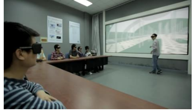
The virtual simulation system Fig. 1.

We should strengthen cooperation and exchanges with enterprises in the construction of virtual simulation experimental teaching centers, increase investment in the construction of virtual simulation experimental teaching centers, and better serve the development of new products while cultivating talents. Through multi-field and deep-level cooperation, the construction level of virtual simulation experiment teaching center is guaranteed, and the advantages of enterprise in site, equipment and personnel are fully utilized to improve the teaching quality and effect of virtual simulation experiment.