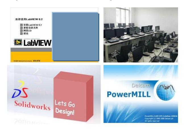
Fig. 4. The virtual simulation system

The virtual simulation experiment interface