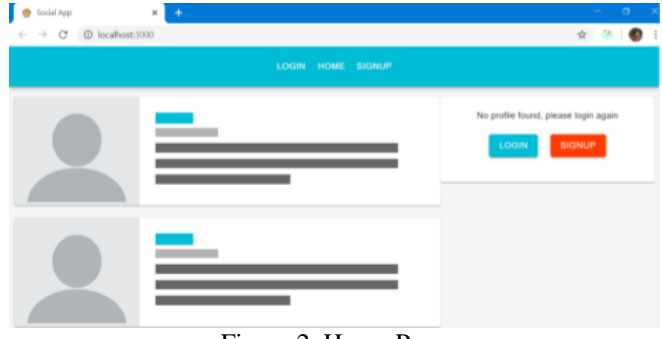
Figure 2. Home Page

5) Get login to our website to and you can give feedback and complaints that is required to make our company more concern and give bests service ..