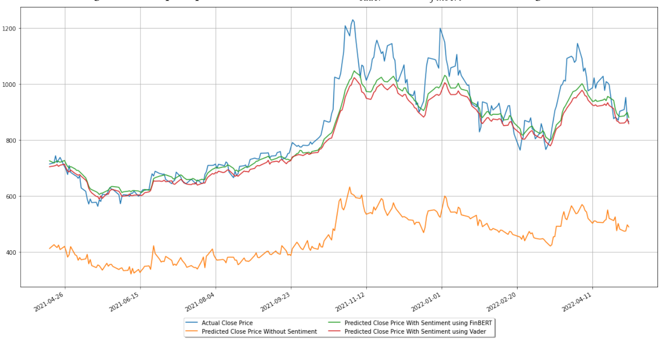
Figure 3: Close price prediction of Tesla with Y, Y+T<sub>vader</sub> and Y+T<sub>finbert</sub> datasets using LSTM