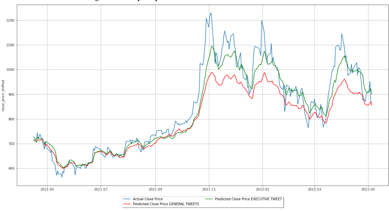
Figure 4: Close price prediction of Tesla with Y+G and Y+E Datasets

by these organizations. Consent of individual users for using their posts was not necessary.